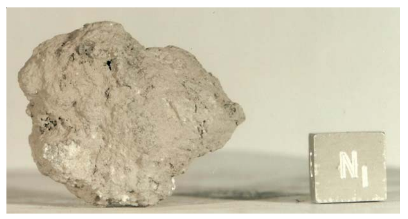
Figure 1: Photo of 64478 with cm cube. S72-40139